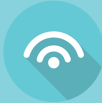
Cable, telephone & Internet