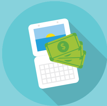
First & last month's rent