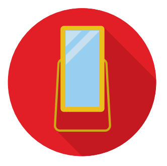
Practising in front of the mirror