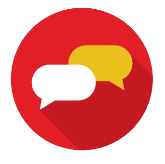
Mock interviews with friends