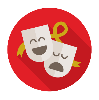
Improv or acting workshops