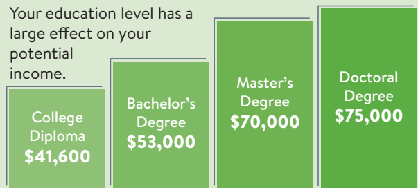
MEDIAN ANNUAL SALARY

Your education level has a large effect on your potential income.